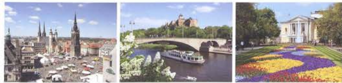
The Market Place | Giebichenstein Castle and river Saale | Opera