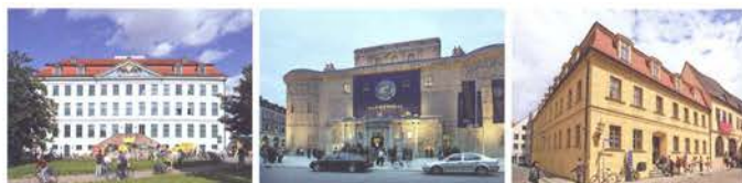
Francke Foundations | State Museum for Ancient History | Handel House

However, it is not only the economic situation and infrastructure which makes our region an interesting place to live; it is also the beauty of the region, which is rich in tradition and culture, rivers and lakes, castles and fortresses, parks and gardens.