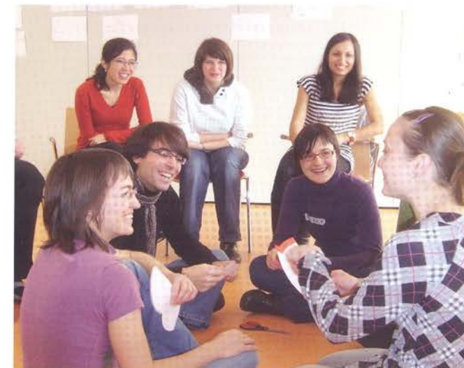
International PhD students in an intercultural seminar

Today, the certificated family-friendly University offers over 350 degree courses in the humanities, social and economic sciences, natural and agricultural sciences, as well as medicine, law and theology.