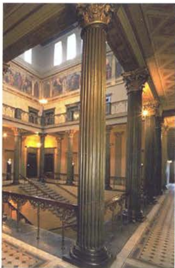
Inside of the classic lecture hall "Löwengebäude"